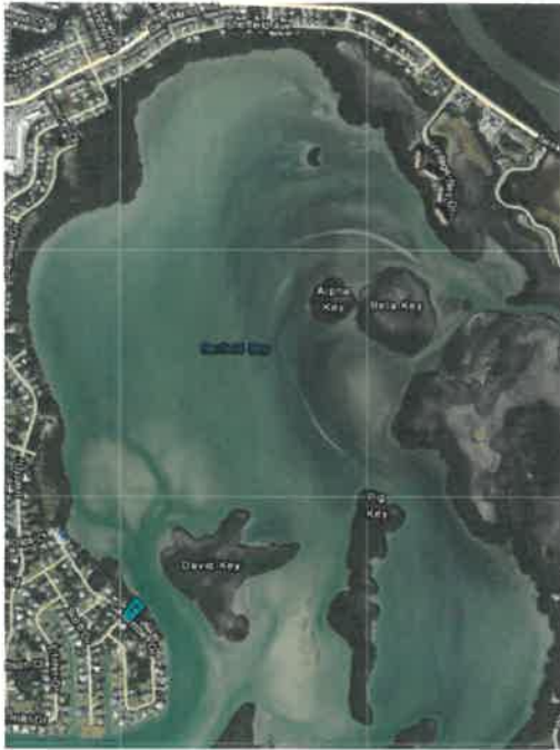
Photo 1: Overview of the Barfield Bay Area. Highlighted is the subject property.

picture of the subject property can be seen in the photos below. As can be inferred from the photos below, nearly all docks in the vicinity of the subject property require a BDE and most are of a comparable square footage as well.