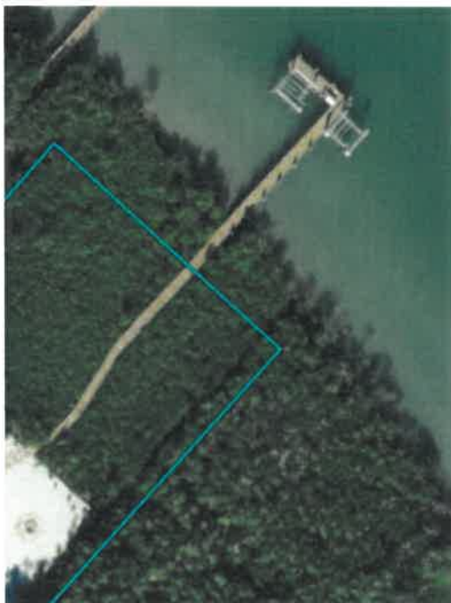
Photo 3: The Havemeier's existing docking facility, consisting of 987 square feet of over water structure, protruding 98' from the property line and 131' from the MHWL