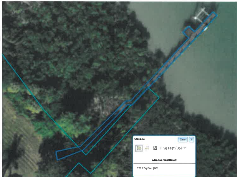
Photo 7: Dock at 875 Caxambas Dr. consisting of roughly 1,000 square feet of over-water structure, protruding roughly 95 feet from the property line.