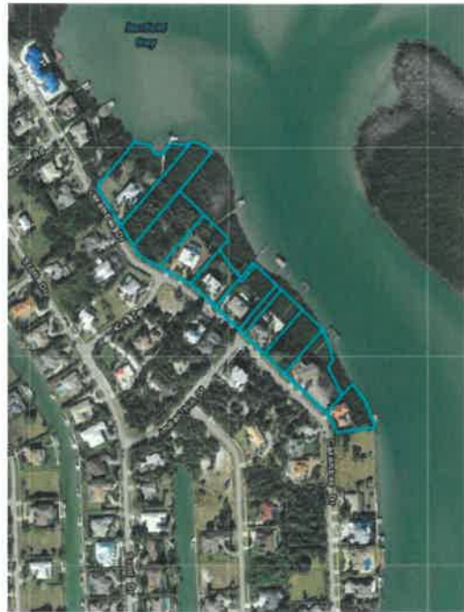
Photo 2: General area of subject property containing comparable docking facilities