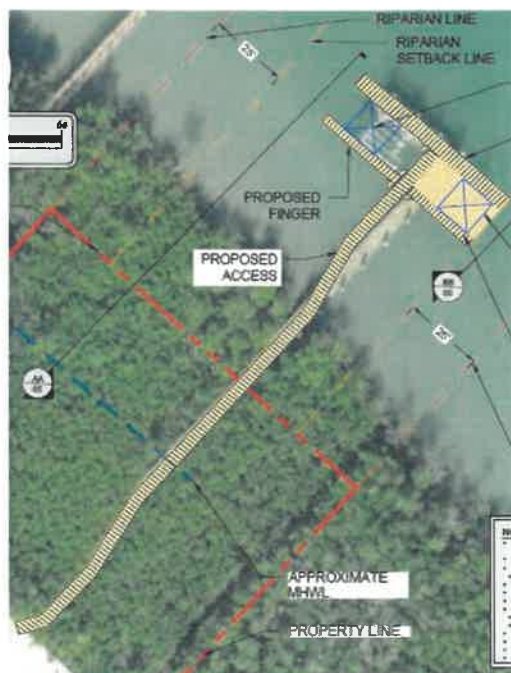
Photo 4: The Havemeier's proposed docking facility, consisting of 1,570 square