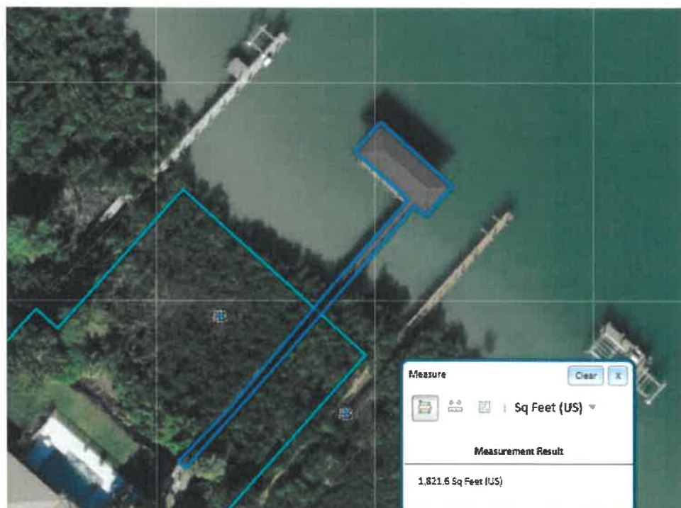
Photo 8: Dock at 885 Caxambas Dr. consisting of roughly 1,800 square feet of over-water