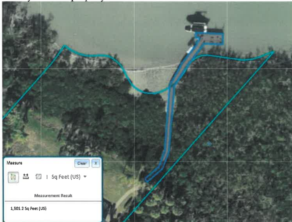
Photo 5: Dock at 831 Caxambas Dr. consisting of roughly 1,500 square feet of overwater structure and protruding roughly 40' from the nearest property line.