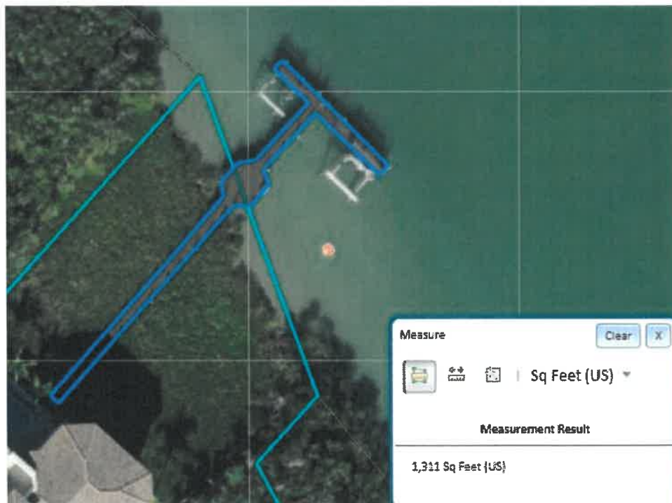
Dock 10: Dock at 919 Caxambas Dr. consisting of roughly 1,311 square feet of over-water structure, protruding roughly 60' from the property line.