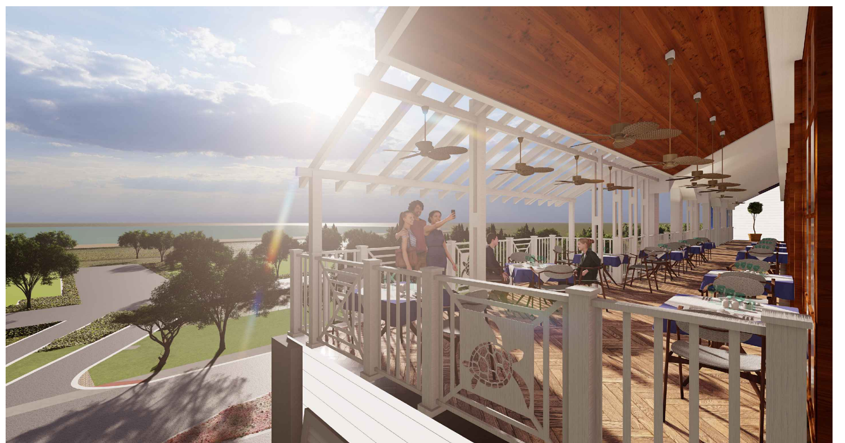
S. COLLIER BLVD - RESTAURANT - SW CORNER 1/16"=1'-0"

These plans are part of the package for Planning Board