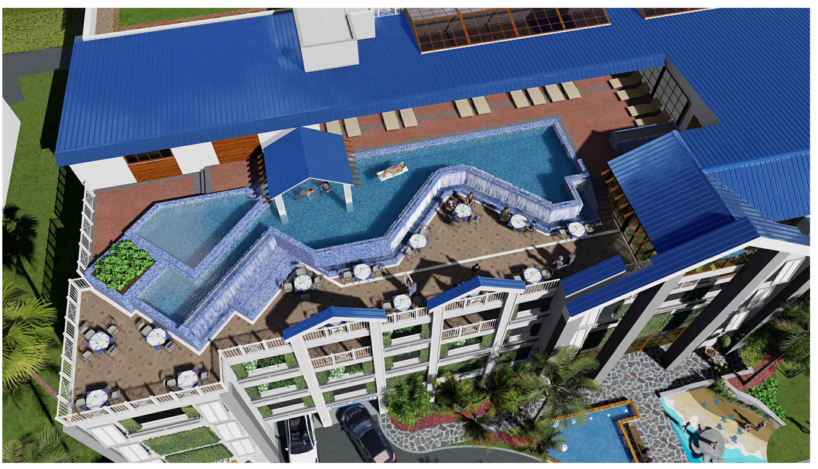
S. COLLIER - ROOF TOP - POOL DECK 1/16"=1'-0"