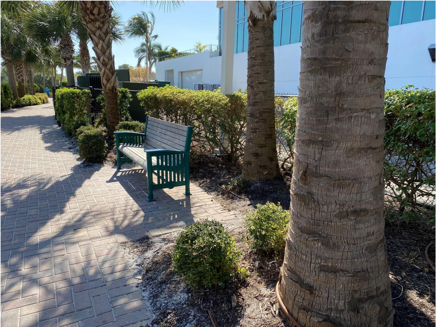
Photo: bench midway along the path

Benches: There are three benches on the path: at the entrance, at the transition to the boardwalk, and midway along the path. All three benches are sturdy and in good condition. The benches will remain in current locations and be power washed when needed.