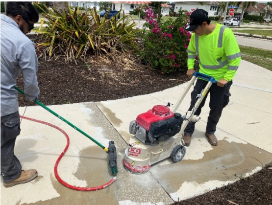
Sidewalk Grinding on Shared Pathways