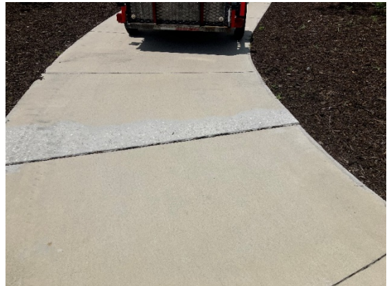
Completed Sidewalk Grinding