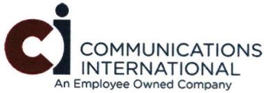
Exhibit G-2 Contract 15-6409