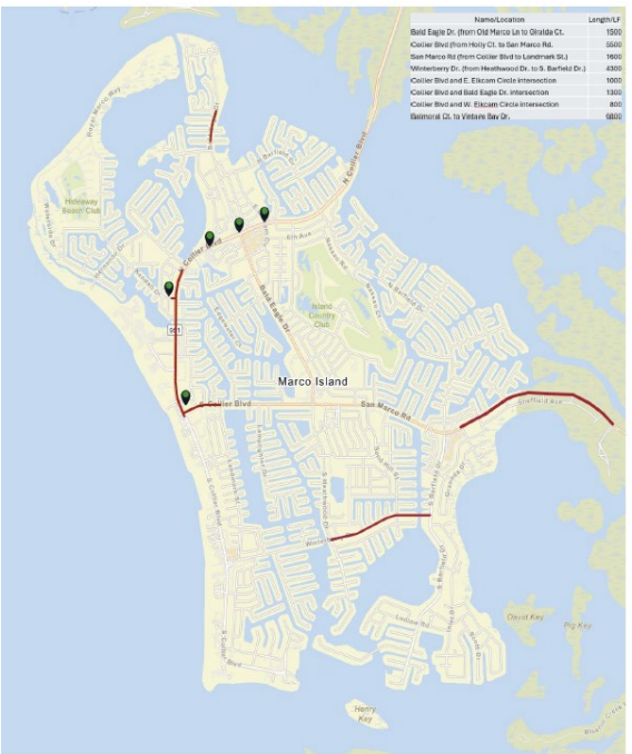
2025 City of Marco Island – Road Restriping

Restriping will take place during regular business hours.