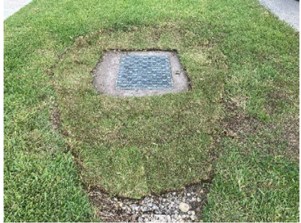
Stormwater outfall repair due to contractor cable damage.