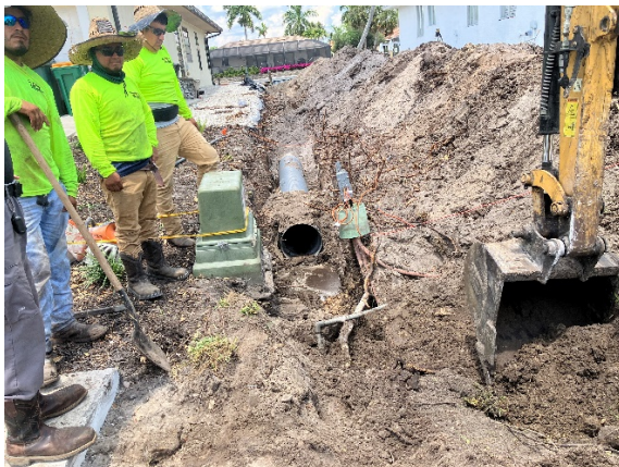
Stormwater outfall replacement on Chestnut Ct.