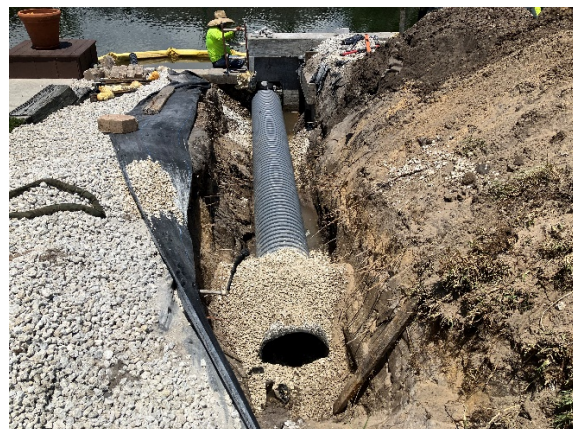
Repair of storm drain filter blockage issue on Cara Ct. Rock removed and replaced with sod.