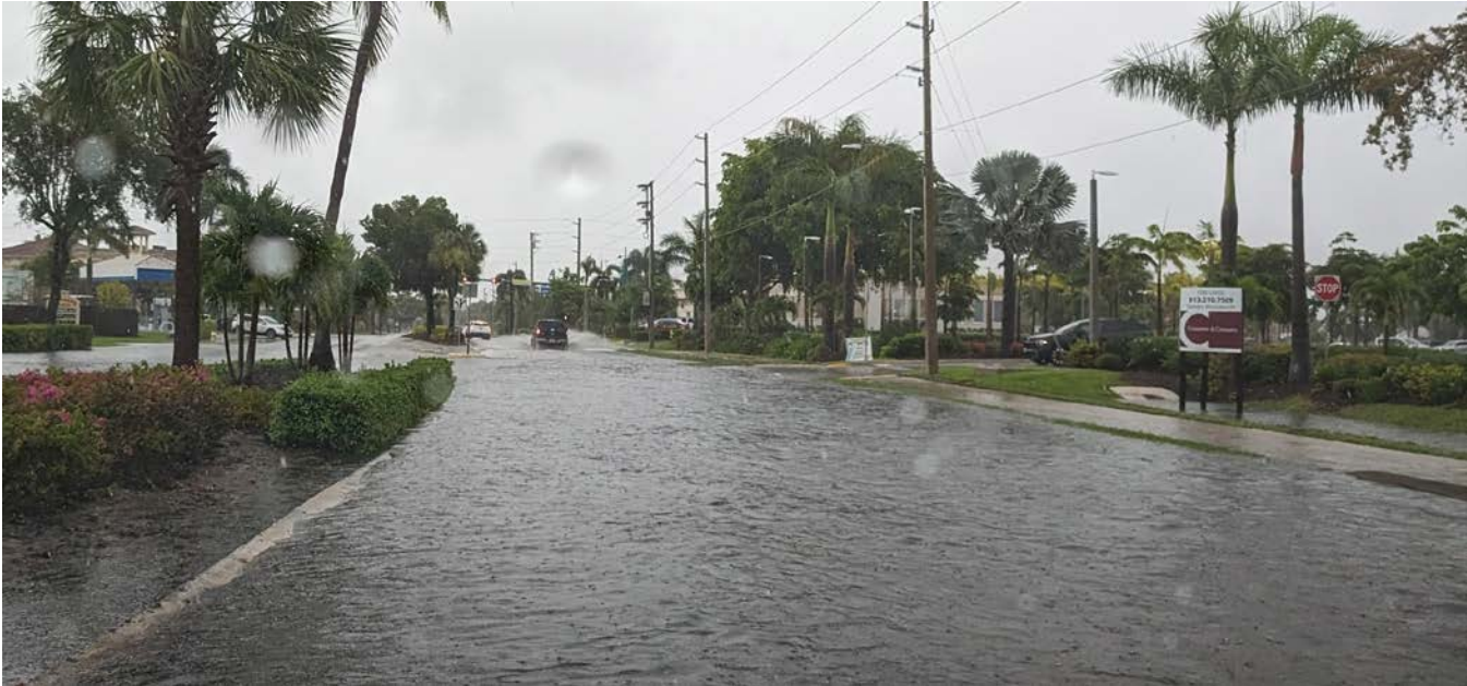
S. Barfield Dr.