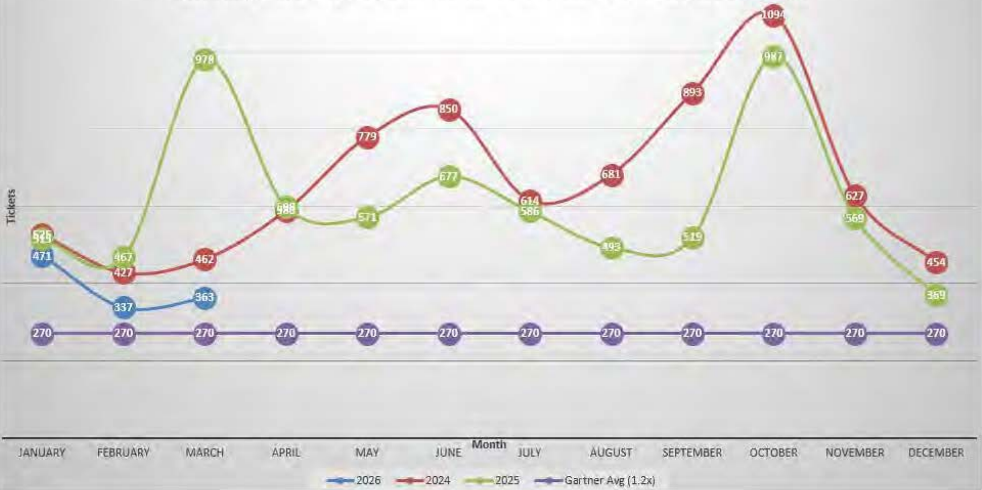
CMI Help Desk Ticket Trends Year over Year vs. Gartner Average