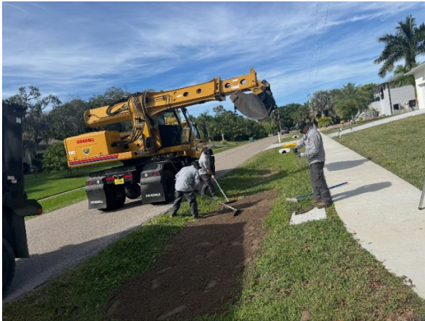
Swale grading at Tarpon Ct