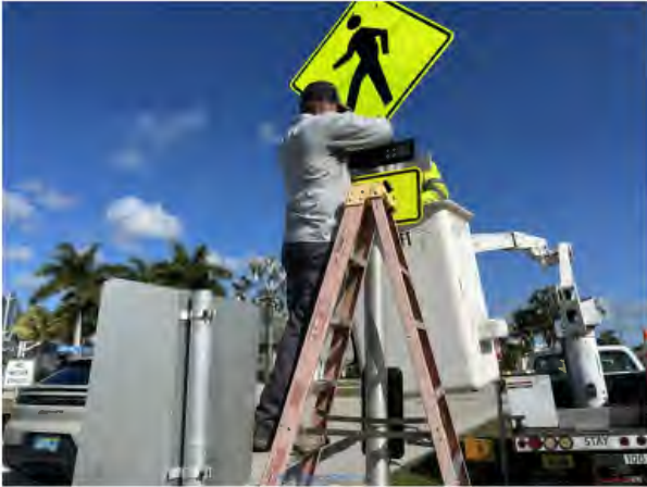
Sandhill and Leland crosswalk installation.