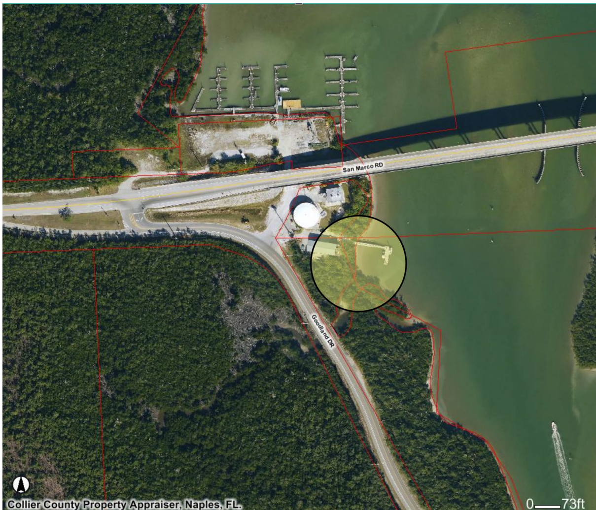
Aerial of the Site:

Zoning: A-ST (Agricultural – Special Treatment Overlay) Parcel #: 58620040007 Legal Description: MARCO BCH UNIT 20 ALL, PARCEL 1 , LESS THAT PORTION OF GOODLAND MARINA DEV AREA FURTHER DESC IN OR 1125- 1266, OR 1125 PG 1237