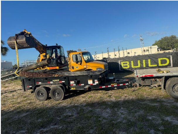
Removal of tree from roadway on S. Collier and Winterberry