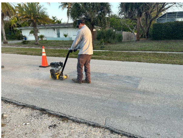
Auburndale removed old school markings in roadway