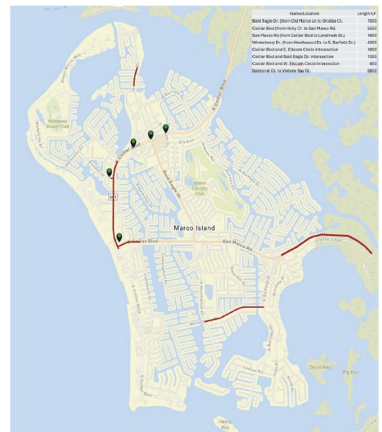
2025 City of Marco Island – Road Restriping

Major restriping will take place during nighttime hours, while smaller segments will be striped during regular business hours.